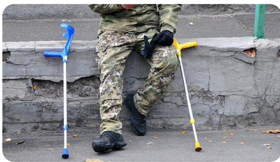
Insufficient access to rehabilitation and medical services