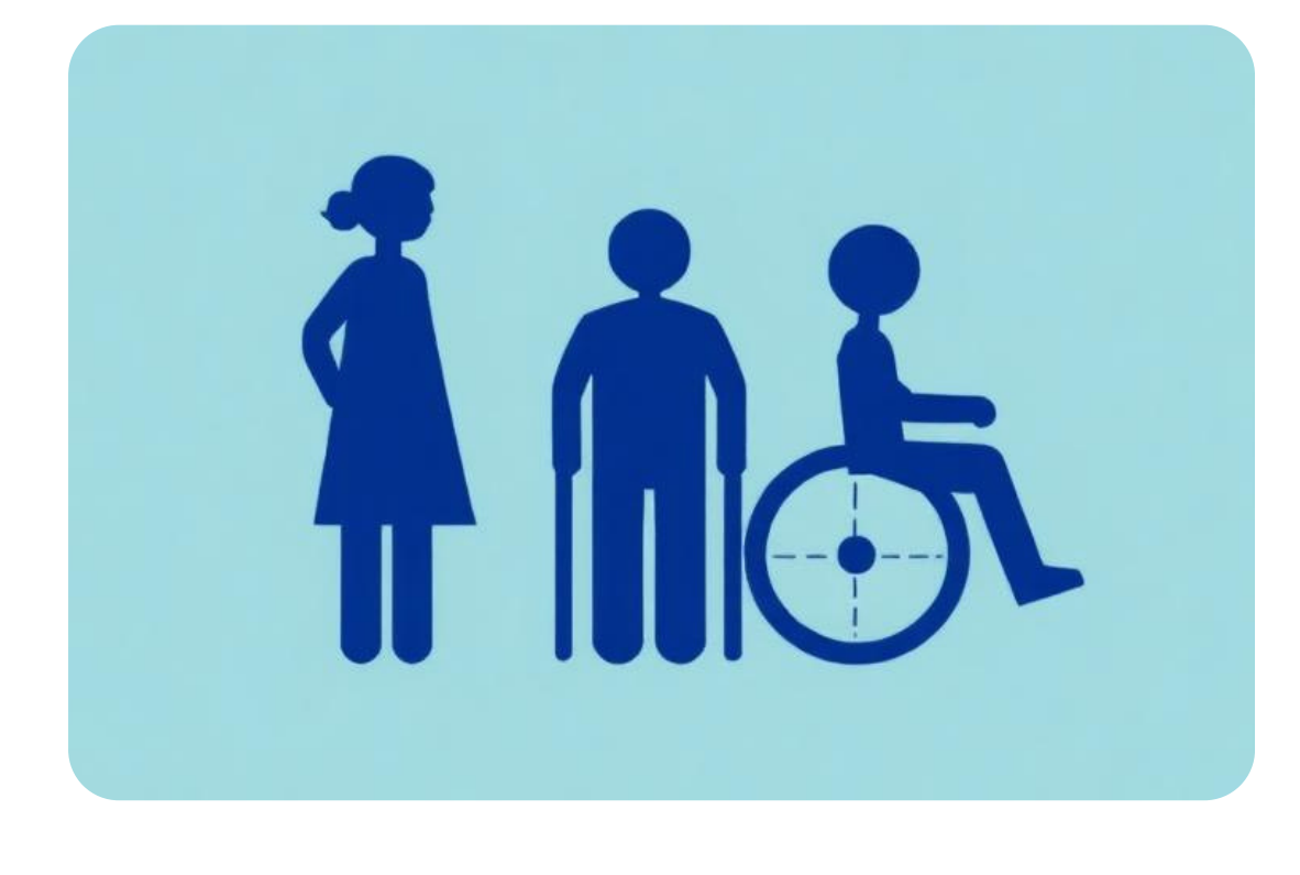
Social exclusion and discrimination