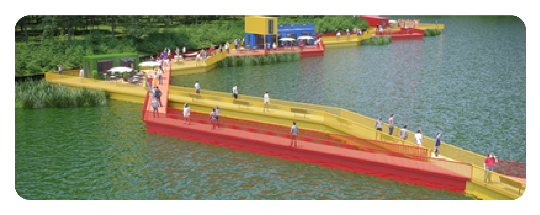
Inclusive paths on the water