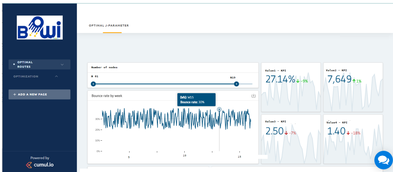
Fig. 2. An example of dashboard operation with the results of calculating the optimal route of a grain elevator for a given batch of grain using the developed intelligent technologies

To provide greater visibility of the decision support process, the process operator is shown not only the final calculation results using formula (4), but also the optimal action diagram. By scrolling, you can select the required number of nodes on the route. On the graph, you can view information about the corresponding node. Also, the operator will be shown the main KPIs of this route, which will allow him to make high-quality management decisions at the post (Fig. 2) [2].